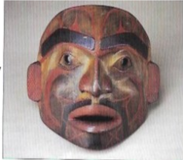
13. Portrait mask, Haida, Haida Gwaii (Queen Charlotte Islands) nineteenth century. Wood, paint. 7 1/4" high, 8 1/4" wide (18.5 cm x 21 cm). Acquired from the Somerset Archaeological and Natural History Society, Taunton, England. Acc. No. 42.11/DPT 5300.