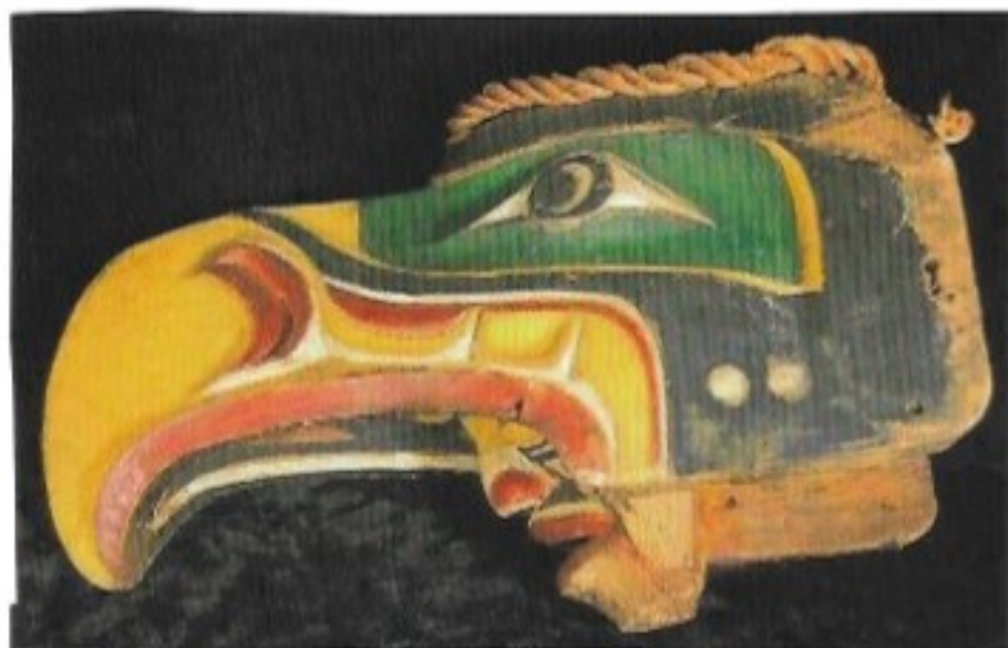
2. Quatsino ancestor mask showing eagle/human transformation (two views), early twentieth century. Complex transformation masks are typical of the central NWC during the ethnohistoric period. Cat. No. AA106.